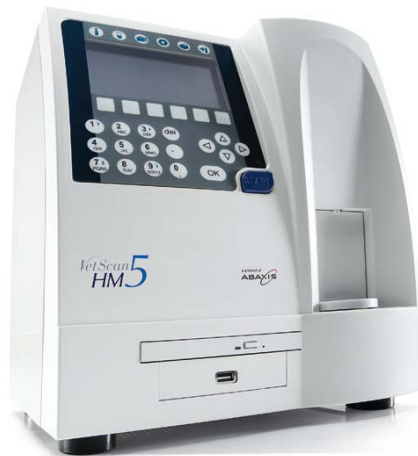
VetScan HM5 TM