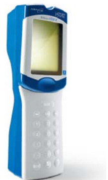
VetScan i-STAT1 ®

ABAXIS Europe GmbH Pekapark, T9 Otto-Hesse-Straße 19 D-64293 Darmstadt Germany www.abaxis.de